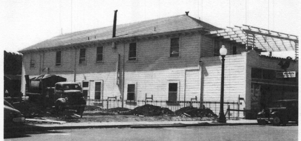
San Anselmo Hotel with roof garden, 1947.

storefronts were leased to many different tenants over the years. Red Robin Sandwich Co. was located there in the 1940s making sandwiches and distributing